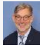
Dr. Robert Levine

09:00 AM_____ 10 Keys for immediate implant success. Extraction Socket Evaluation for Mastering Immediate Implant and Special considerations for immediate implant placement. Attendees will learn to expertly evaluate pre-extraction sockets and understand how to assess bone and soft tissue conditions for optimal immediate implant placement. They will also gain insight into various techniques and factors for a successful implant outcome. Attendees will learn to tailor their approach and techniques to achieve optimal outcomes in various clinical situations.