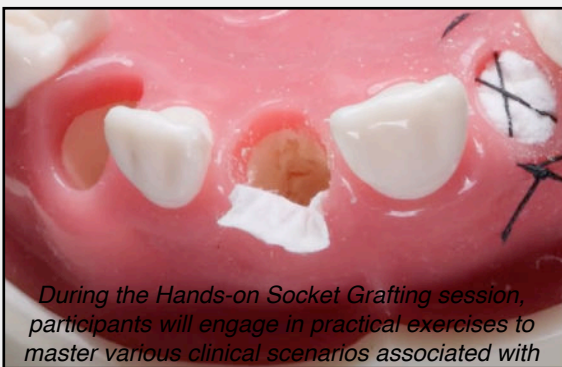
During the Hands-on Socket Grafting session, participants will engage in practical exercises to master various clinical scenarios associated with socket grafting.