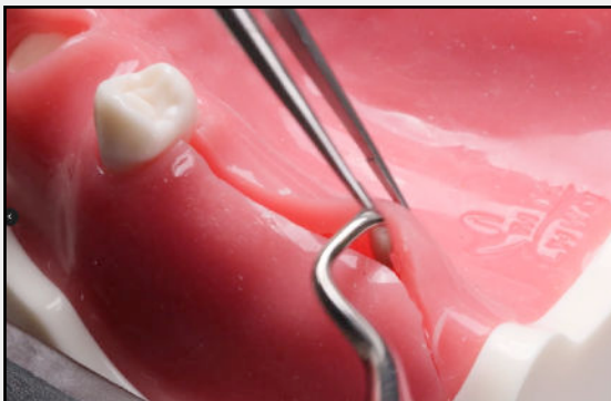
Attendees will be provided the opportunity to work with diverse grafting materials and techniques, allowing them to gain valuable experience and confidence in managing a range of clinical cases. The session aims to equip dental professionals with the skills and knowledge necessary for successful socket grafting.