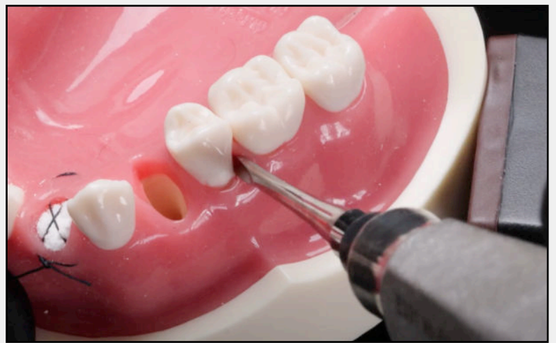
This session also covers the fundamentals of flap design for dental implant placement, including precise mid-crestal and vertical releasing incisions for optimal access and visibility. Essential suture techniques will be demonstrated to promote predictable healing and minimize postoperative complications.